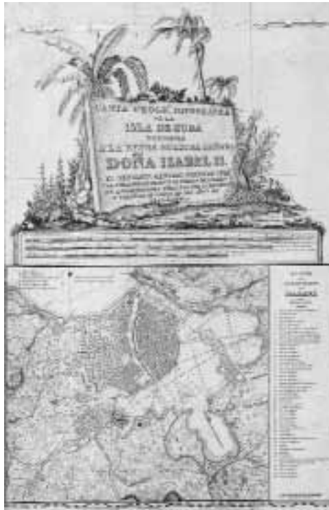
[Detail of cartouche with inset map of Havana]